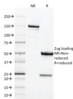
SDS-PAGE Analysis of Purified CD71 Mouse Monoclonal Antibody (TFRC/1818).